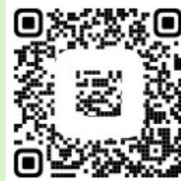
Two Players ($145.00)