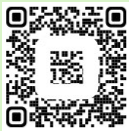
One Player ($105)

When: August 29th 10:30AM ( Don Clay to confirm tee times) Where: Golf at The Resort at Mt Hood / Three Nines Golf Course What: His and Hers golf tournament with more details to come reach out to djclay45@msn.com to confirm your spot in the tournament. Cost: $100 per player plus processing fee if paying with a card. We have to pay through the club so you need to get money in no later than 10 days before the tournament or August 19. Don will collect Mulligan and food cash at the tournament. Here are QR codes if you want to use a card. One for a single greens fee and one for two greens fees: