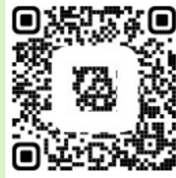
Two Players ($210)